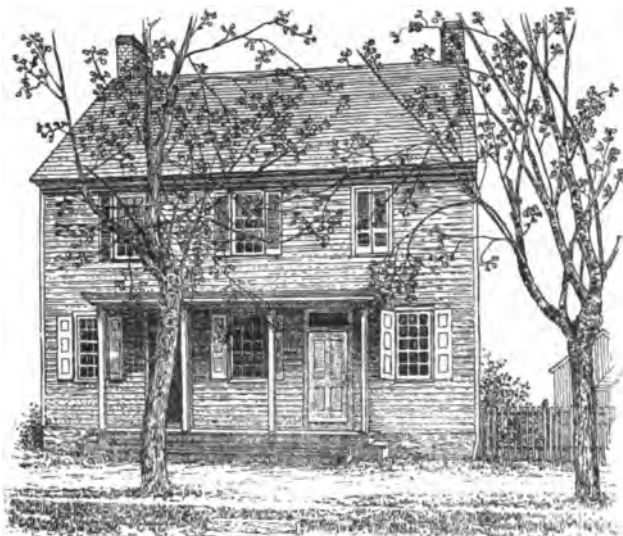
Joel Bodine House

lived at Swago, now Harrisville, in Little Egg Harbor Township, Burlington County. Little Egg Harbor Township was established in 1741, and embraced an extent of territory which was later divided to form other townships. After the formation of Washington Township, in 1802, the boundaries of Little Egg Harbor were: Bounded north